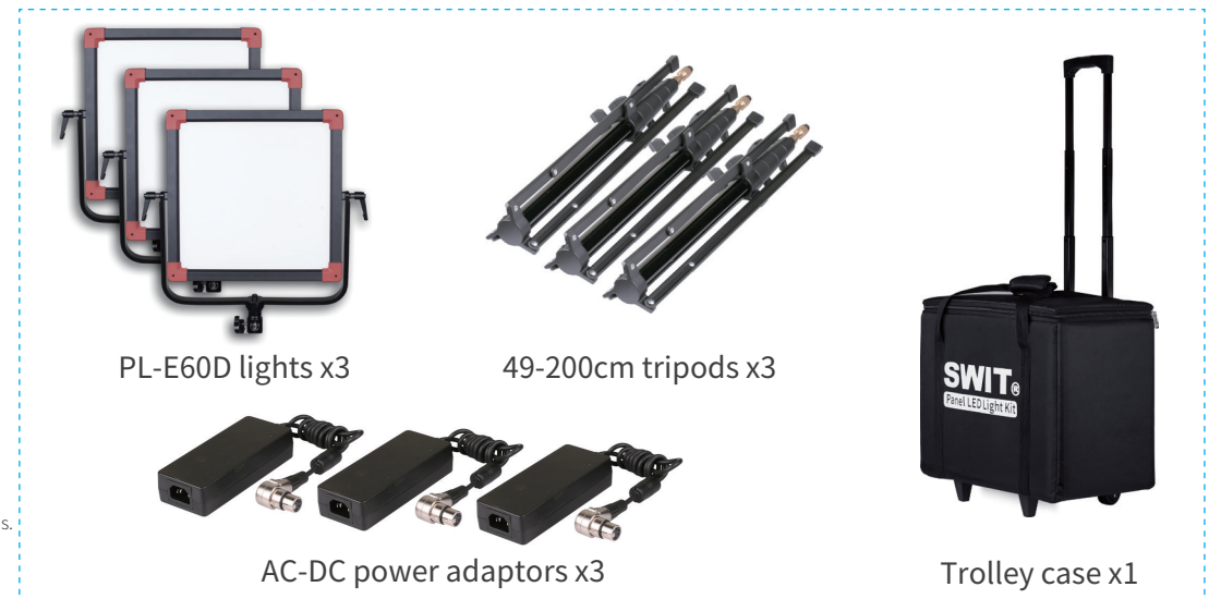
PL-E60D lights x3