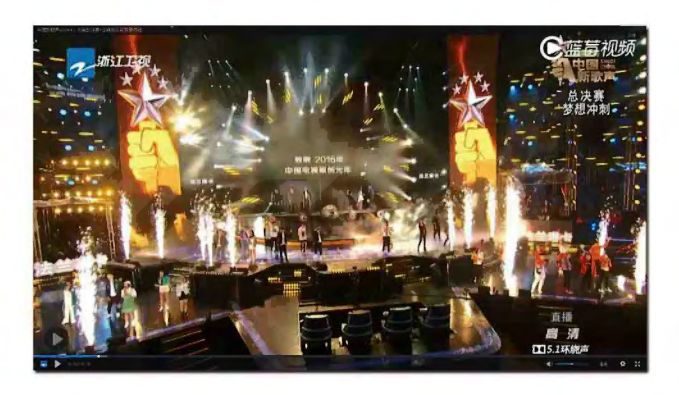
Final of Sing! China – Zhejiang TV