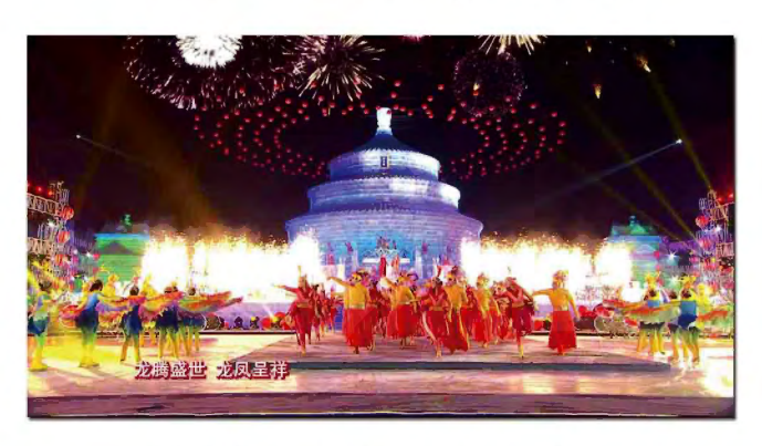
CCTV Spring Festival Evening Party