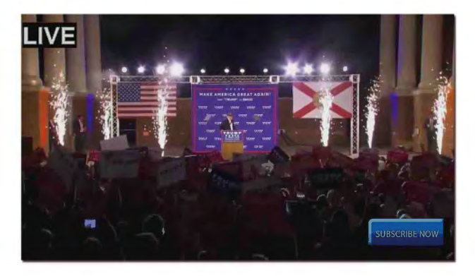
Donald Trump Rally in Pensacola, Florida