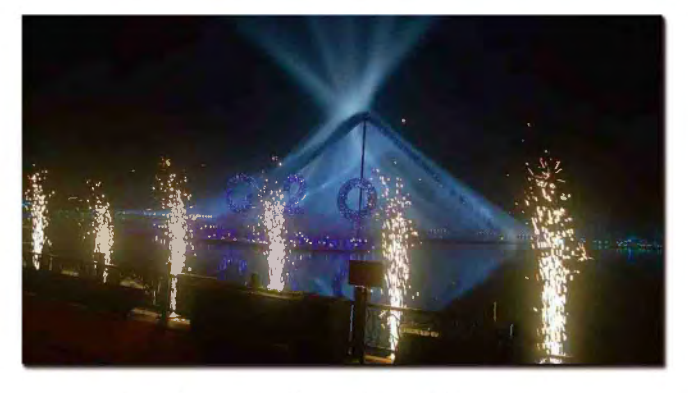
G20 Summit-Hangzhou, China 2016