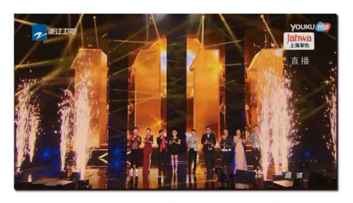
Tmall 11 • 11 Global Shopping Festival