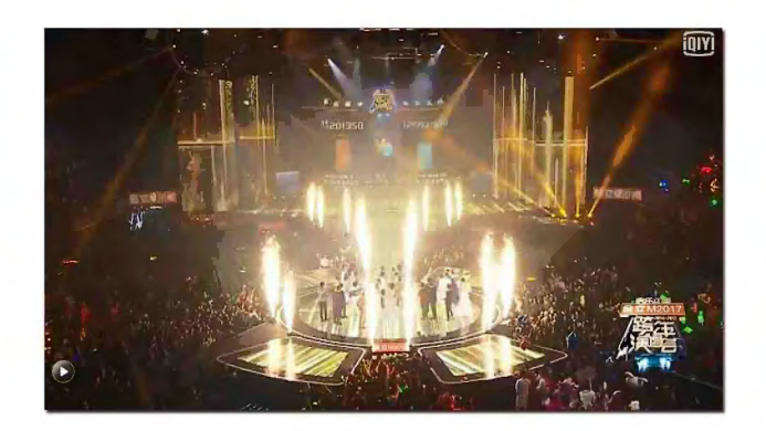
New Year's Concert - Hunan TV